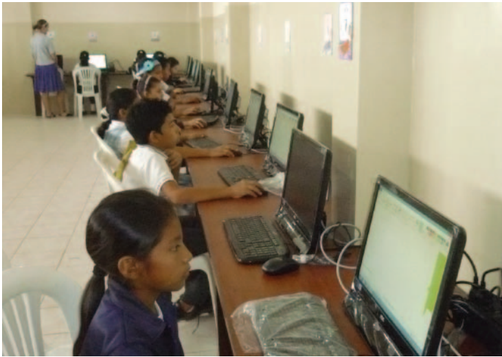
Students hard at work in the new computer lab.

My introduction to Catechesis Familiar , a family based catechesis program which encourages parents to take the lead role in handing on the faith to their children, was an especially moving experience. Each week it was a very rich blessing for me to witness young people filled with enthusiasm and joy as they shared their faith with each other, teaching each other about God, Church, and Social Action. What a wonderful grace it has been for me to be part of all of this. Another memorable experience is working with missionary sisters from Colombia and the Archdiocese of Guayaquil, in building a new Catholic primary school in the parish. I never learned so much about bags of cement, wages, scaffolding, etc. And looking back now I can laugh at myself when I see how many times my blood pressure rose when confronted with bad work, slow work or even at times..... no work!!