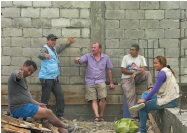
Parish volunteers in Mt. Sinai build a home for a poor family.

poor taught me that our God is a God of the poor, a God who is right there with them in the middle of their suffering. God was in Monte Sinai long before I arrived and will continue to be there in a very real way. To see hope arise and people's lives improving, albeit at a very slow pace, makes me realize more and more that any good we can do to 'urge others on' along the way is very noble and Christian.