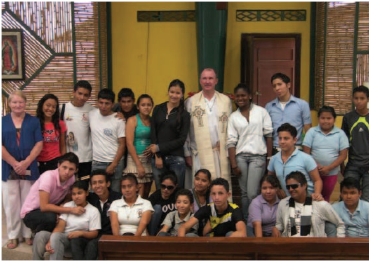
The youth and music group meets faithfully every week.