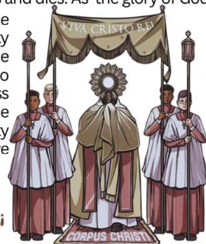
Feast of Corpus Christi

In us and through us Christ lives and loves. In us also He suffers and dies. As the glory of God shone through the ordinary humanity of Jesus at the transfiguration, so may God's goodness shine through the ordinary humanity of ours as we live our daily lives.