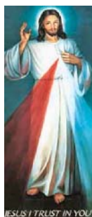
IESUS I TRUST IN YOU

Extraordinary Jubilee of Mercy. To pay homage and to invoke Almighty God's infinite gift to Mankind His Mercy: Divine Mercy Devotions, Confessions, and Holy Mass.