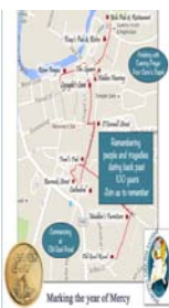
Marking the year of Mercy

Last June due to a very wet Sunday afternoon we cancelled the parish walk. The theme for that walk was 'Marking the year of Mercy' by Remembering people and tragedies dating back past 100 years. This walk will now take place on Sunday 18th of June 2:30pm commencing at the (Old Jail Road- outside Madden's Furniture shop). We look forward to all participating and to a fine day.